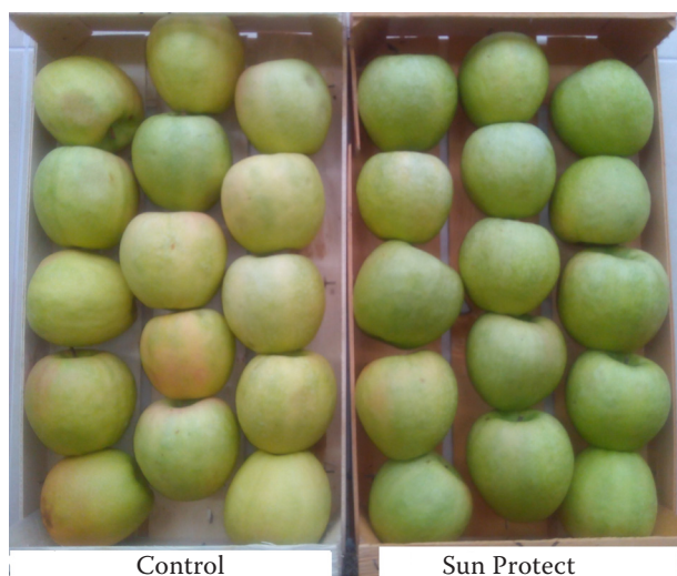
Fig. 2. Coloration of cv. Granny Smith fruits after 4 months in storage

means in the same column for each year followed by different letters are significantly different (Fischer's F -test, P \leq 0.05 ); AAE – ascorbic acid equivalents, GAE – gallic acid equivalents