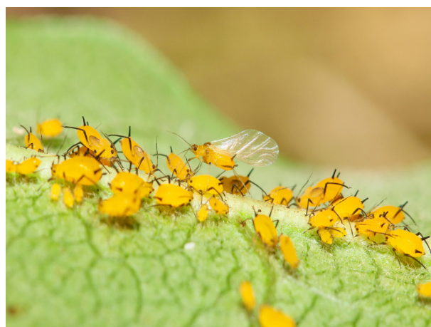
Figure 1. Aphis nerii parthenogenetic females hosting on Asclepias syriaca in south-western Slovakia

For the A. nerii distribution research in Slovakia, citizen science – crowdsourcing on the social networking platforms – designed by Dickinson et al. (2010) and Chamberlain (2018) was also utilised. We adapted this method for the A. nerii Slovak distribution survey. In January 2019, we co-opted the five largest Facebook social media gardening groups moderating in the Slovak language. These