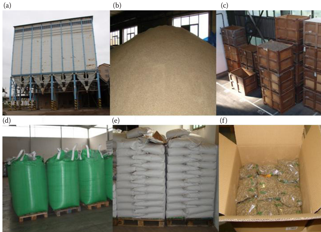
Figure 2. Most of the commonly used seed stores and packages are sensitive to attack of stored pest arthropods and rodents: (a) seeds in silos, (b) seed heaps in flat stores; (c) seeds in wooden boxes; (d) seeds in big bags (1000 kg); (e) seeds in medium bags (30–50 kg); (f) seeds in small bags (100 g to 5 kg) protected in paper boxes

We documented (STEJSKAL et al. 2003) a significantly higher infestation of stored wheat and barley by arthropod pests in flat stores than in silos in the CR. In the flat stores, the main risks for infestation are spillage and seed residues inside or in the vicinity of the storage buildings (KUCEROVA et al. 2003, 2005). According to personal communication from several anonymous Czech storekeepers, seeds stored in bags, large bags, bulk containers, and boxes are also sensitive to rodent (mice, rat) (Figures 1a,b) and bird (pigeons, sparrows) attacks. However, even grain stored in silos can be infested by roof rats ( Rattus