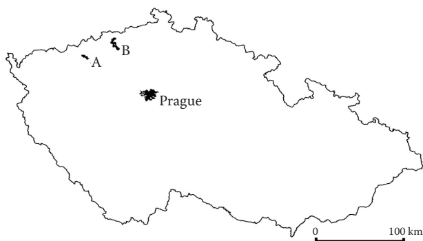
Figure 1. Map of the sampling locations in the Czech Republic; A – area of open cast mining Tušimice, B – area of open cast mining Bílina

Preprocessing methods and validation. Outliers are commonly defined as observations that are not consistent with the majority of the data (PEARSON 2002;