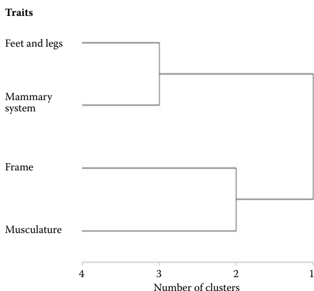
Figure 1. Dendrogram of main conformation traits

Three factors were identified as more than 84% of the variances of main conformation traits. The most important factor covered 34.5% of total variance and was in close correlation with feet and legs and mammary system. There were three factors in correlation with more than one linear trait. Factor I (14.4% of total variance) was in close correlation with rump traits (stature, rump length and rump width), factor II (9.2% of total variance) was in close relation with udder length (fore udder length and rear udder length), whereas factor III (9.0% of total variance) was in correlation with shoulder and kidney. These factors could be identified as rump, udder length and durability as background variables which influence reproduction, milking capacity and length of productive life.