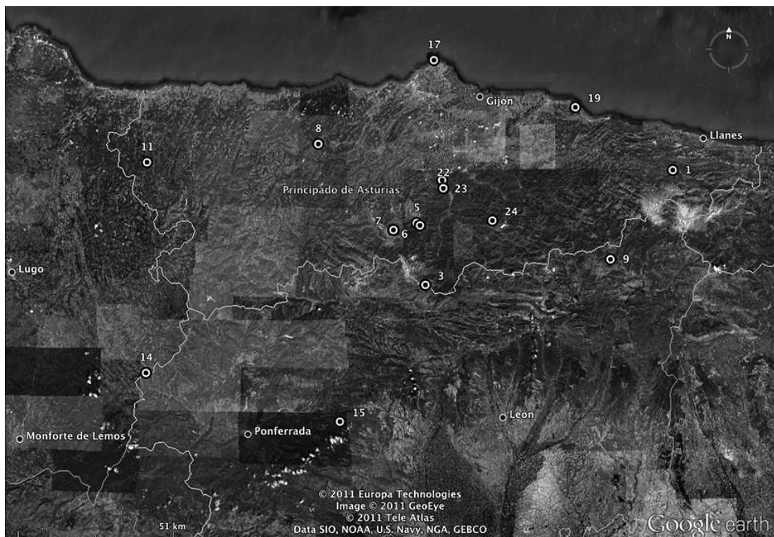
Figure 1. Map of the distribution of the accessions of Trifolium repens collected in the Cantabrian Mountains

The following ten agromorphological (IBPGR 1992) traits were evaluated during the 2-year pe-