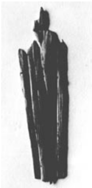
Figure 3. Pyrenophora tritici-repentis pseudothecium on overwintering straw

of information about existence of Pyrenophora tritici-repentis sexual stage in Latvia as yet. An important task is to clarify peculiarities of tan spot development in Latvia, including entity of Drechslera tritici-repentis sexual stage. Pseudotecia was not found on the straw of infected plants directly after harvesting. Dark pseudothecia with matured ascospores were established on the wheat stubble next summer after overwintering (Figure 3). Morphology of ascospores and pseu-