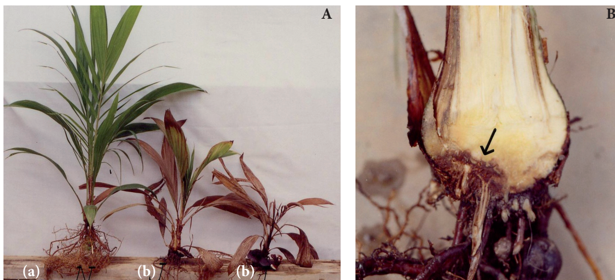
Figure 2. Signs and symptoms of BSR, caused by Ganoderma boninense ; A – healthy plant (a) and infected plants (b); B – necrotic lesion on infected plant (arrow)

plants of control C2 that were artificially inoculated and non-treated. The best disease control was exhibited by T1 (treatment immediately after inoculation). The DSI was increased after 14 weeks and the DSI values for treatments T1, T2 and T3 at week 20 are 5.0%, 25.0% and 45.0%, respectively, as shown in Table 2. The leaves of infected plants were chlorotic and had a white fungal mass on any part of the plants, then formed basidioma before the plants dried (Figure 2A). The cross-section of an infected plant stem showed a necrotic lesion at the vascular region (Figure 2B).