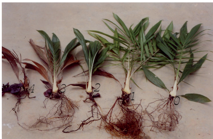
Figure 1. Samples of plants belonging to each of the disease classes: 0 (healthy plant) to 4 (infected and dead plant)

Estimation of the colony forming unit (CFU/g) of Trichoderma in the soils of each control and treatment. Soil samples from controls and treatments were taken with a 1 cm diameter sterile cork borer. It was pressed into the soil to a depth of 8 cm, and a 10 g soil sample was mixed in 100 ml distilled water by shaking in an orbital shaker at 100 rpm for 10 minutes. Serial dilution of the soil sample was conducted until 10^{-3} dilution and 1 ml of the final ( 10^{-3} ) diluted soil was pipetted into a Petri dish. Then, 9 ml of Rose Bengal Agar (RBA) was poured onto the diluted soil, gently shaken and left to cool. Cultures were done in three replicates and incubated at 28 \pm 1^\circ\text{C} . The cfu for each control and treatment were counted and recorded after 5 days. The colonies were cultured on slides and observed the morphological characteristics for species identification.