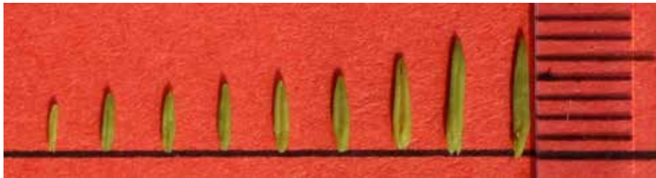
Figure S1. The anther length from some varieties at YL during the growing season (2014–2015) The name of accessions from left to right: Nongda 211, Jing 411, Zhoumai 19, Jimai 20, Zhoumai 28, Zhenmai 16, Ke-chengmai 1, Lumai 11, Chuanmai 41