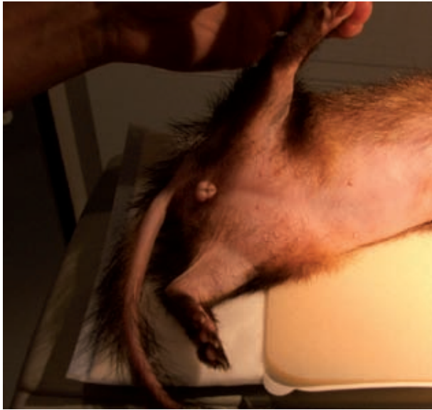
Figure 1. Female ferret ( Emmy ) showing swollen vulva and clinical sign of hyperoestrogenism (alopecia) after her ovariectomy

of the body (Figure 1). Body condition was very bad despite her good appetite. Later, she lost her appetite and became apathetic. As a first step, she was treated with 150 IU hCG (human chorionic gonadotropin) three times, seven days apart to exclude ORS. Despite this hormonal treatment, oestrous signs did not disappear and the clinical signs did not change. The second ferret ( Pipi ) was a three year old female. She was neutered during her pregnancy when she was two years old. Next spring after the ovariectomy she had developed a swollen vulva and began losing the hair on her tail and then on the dorsal side of her neck. This hair loss was