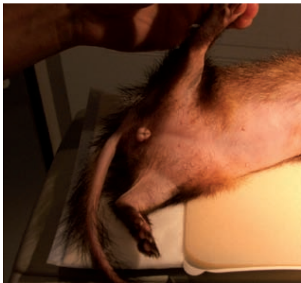
Figure 1. Female ferret ( Emmy ) showing swollen vulva and clinical sign of hyperoestrogenism (alopecia) after her ovariectomy

of the body (Figure 1). Body condition was very bad despite her good appetite. Later, she lost her appetite and became apathetic. As a first step, she was treated with 150 IU hCG (human chorionic gonadotropin) three times, seven days apart to exclude ORS. Despite this hormonal treatment, oestrous signs did not disappear and the clinical signs did not change. The second ferret ( Pipi ) was a three year old female. She was neutered during her pregnancy when she was two years old. Next spring after the ovariectomy she had developed a swollen vulva and began losing the hair on her tail and then on the dorsal side of her neck. This hair loss was