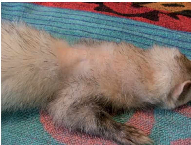
Figure 2. Male ferret ( Peti ) displaying endocrine alopecia due to hyperoestrogenism on the dorsal side of the neck three years after castration

of the body (Figure 1). Body condition was very bad despite her good appetite. Later, she lost her appetite and became apathetic. As a first step, she was treated with 150 IU hCG (human chorionic gonadotropin) three times, seven days apart to exclude ORS. Despite this hormonal treatment, oestrous signs did not disappear and the clinical signs did not change. The second ferret ( Pipi ) was a three year old female. She was neutered during her pregnancy when she was two years old. Next spring after the ovariectomy she had developed a swollen vulva and began losing the hair on her tail and then on the dorsal side of her neck. This hair loss was