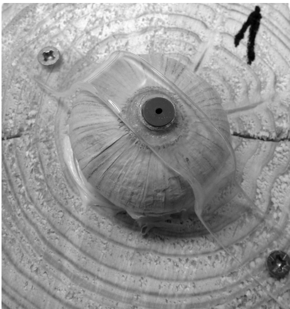
Figure 1. Single clove garlic with attached rubber septum

Penetration of HCN into garlic tissue. The evaluation of the penetration of HCN into garlic cloves was conducted in a hermetic fumigation chamber. Garlic for testing was prepared by hollowing the single cloves of garlic and attaching a rubber septum onto the hollow area (Figure 1). Treatments were conducted in a stainless hermetic steel fumigation chamber equipped with an air lock, forced ventilation and rubber glove manipulators (Figure 2). An image and technical details of this chamber are described in a previous