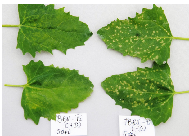
Figure 1. Local symptoms on the C. quinoa leaves caused by the mechanical inoculation of the TBRV-Pi with DI RNA (left) and TBRV-Pi without DI RNA (right)

DI RNA – defective interfering RNA; TBRV-Pi indicates + DI RNA; TBRV-Pi indicates – DI RNA