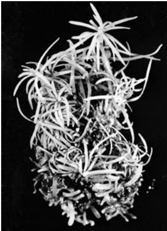
Fig. 1. Formation of needles and shoots developed from adventitious buds induced on cultured isolated vegetative bud of Larix decidua

Initiation of adventitious buds and shoot multiplication was stimulated by combinations of cytokinin and auxin in