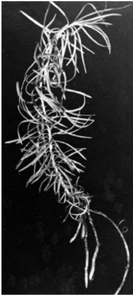
Fig. 3. Rooted microshoot of Larix decidua . Shoot developed from an adventitious bud induced on a needle

(0.1–0.3 mg/l) for 3 to 4 weeks. After the transfer on the medium lacking cytokinin, where shoot tips were cultured in normal position, shoots developed from induced adventitious buds.