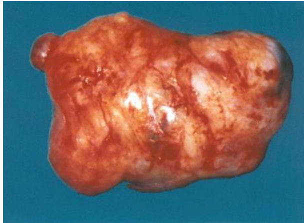
Figure 1. Macroscopic appearance of the neoplasm (10 × 7.0 × 4.0 cm in size, ovoid-shaped with smooth surface and a few lobules)