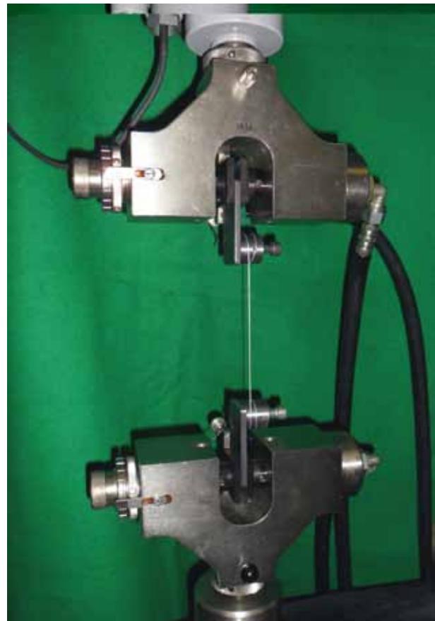
Figure 1. Wrapped material construct on the servo-hydraulic material-testing machine

Three samples of each suture were tested for load to failure. Material testing was performed using a servo-hydraulic materials-testing machine (TIRAtest 2300, VEB TIR NDR). The Certificate of Authentication number of the machine was 0305/323.04/11. The samples were divided into