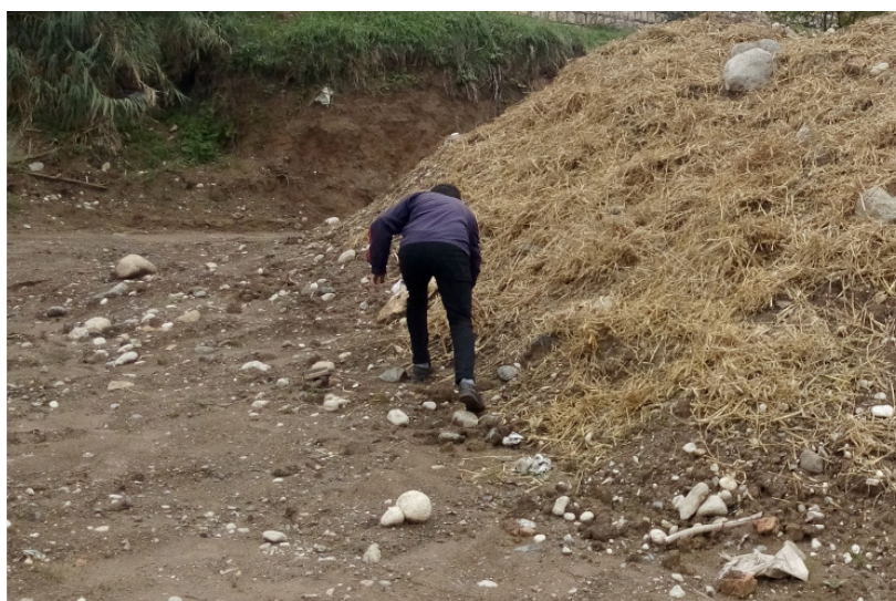
Fig. 1. General view of the study soil and treatments operation

Polyacrylamide (PAM) tackifier is a polymer from acrylamide subunits, is used to increase the soil structure stability. The use of PAM has been recognized as a best management practices (BMP) by the USDA-Natural Resources Conservation Service (NRCS) (BABCOCK, MCLAUGHLIN 2011). The use of acrylic-based polymer mulch is also expanding because of its environmental friendliness and safety. Polyacrylamides are odorless, colorless and non-polluting in surface and underground waters, plant tissues and soil (MANAFI et al. 2016; WANG et al. 2019). Treatments were spread by hand to attain 75% groundcover on soil cutslopes (Fig. 1, Table 1 BABCOCK, MCLAUGHLIN 2013).